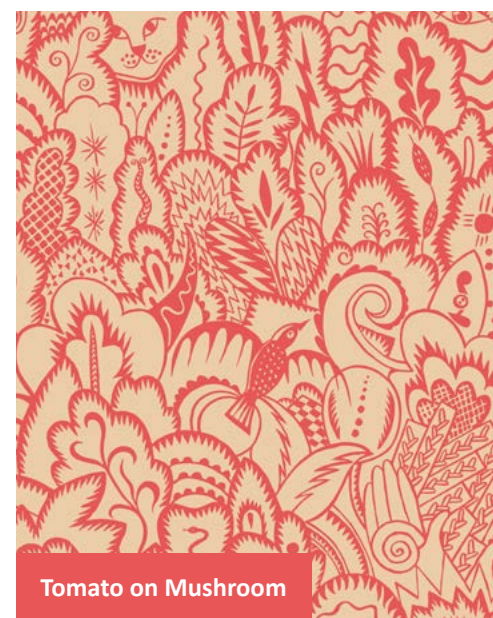
Tomato on Mushroom