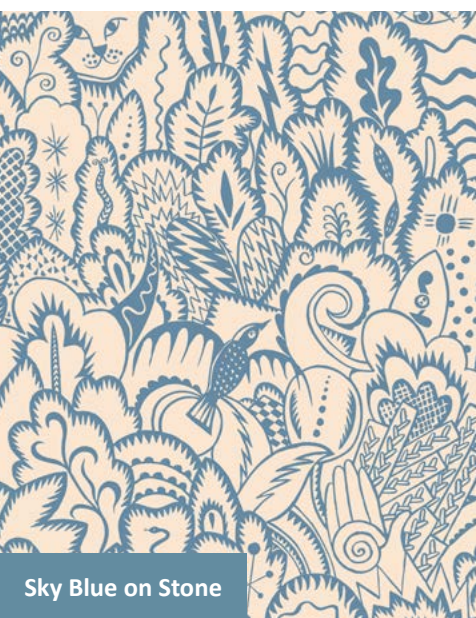
Sky Blue on Stone