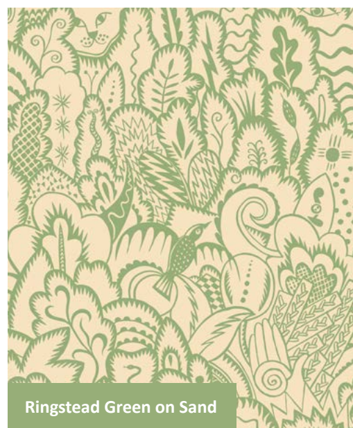
Ringstead Green on Sand