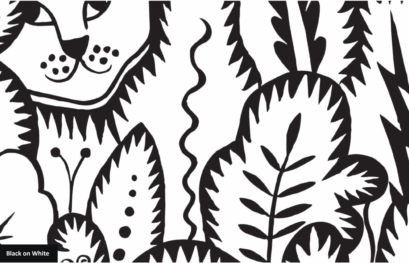
Black on White